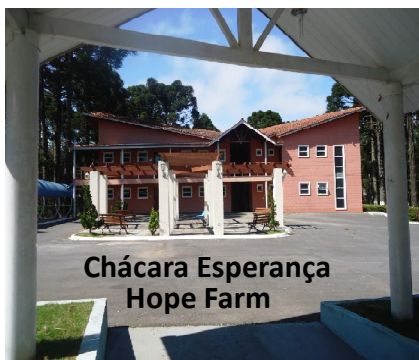
Chácara Esperança Hope Farm