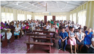
Guyana Conference Session in Kitty Church, Georgetown, Feb. 2014