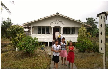
Bona Ventura, Pomeroon, Guyana Church where special anniversary Sabbath service was held Feb, 22.