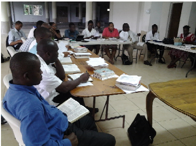
Jamaica Bible Institute students at work (above) and with their teachers (below).