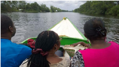
Traveling to Conference on the Pomeroon River--100th Anniversary Sessions in several churches.

The Guyana SDB Conference achieved the significant milestone of 100 years of Ministry in Guyana. Special centennial activities to mark this event were held during the week of February 16-22, 2014. The 100 th anniversary programme commenced on Sunday the 16 th February with a rally and parade leading up to the Launching Service at Parika, East Bank Essequibo, and culminated with a special anniversary Sabbath Service on February 22 at Bona Ventura, Pomeroon.