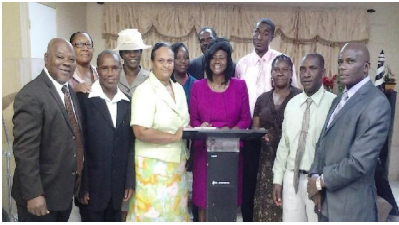
Several from the new Cayman SDB Group along with the crusade team from Jamaica.